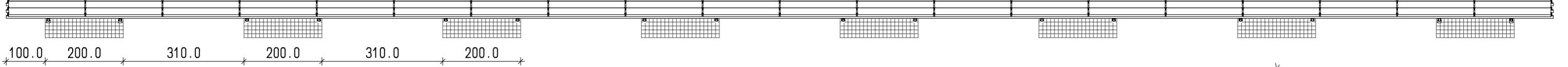
PROSPETTO FRONTALE - scala 1:100